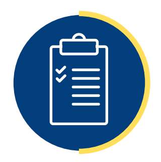
Work Order Integration